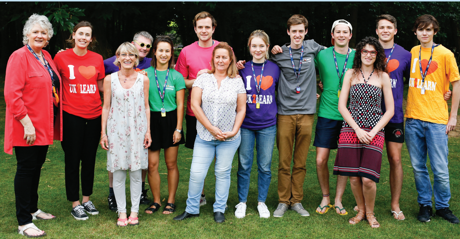
The UK2Learn Team